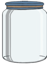
A clear large jar